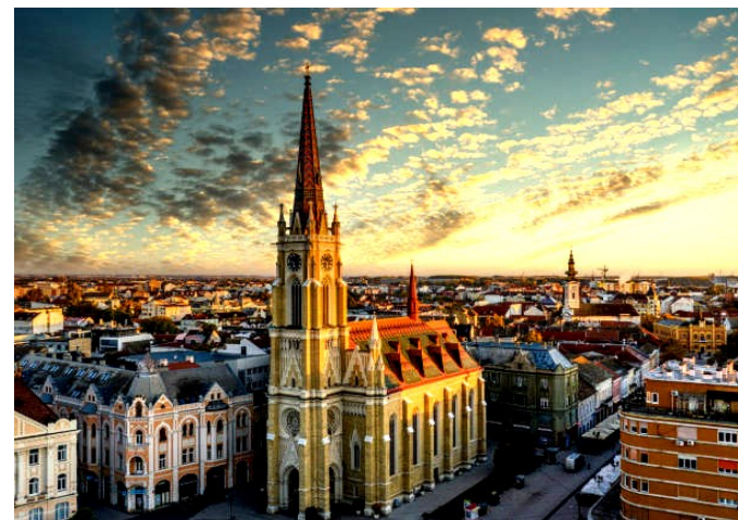
NOVI SAD CATHEDRAL—BELGRADE