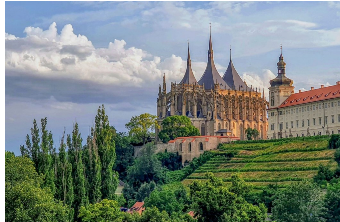
CATHEDRAL OF ST. BARBARA—BRATISLAVA

May 31: After breakfast, transfer to airport.